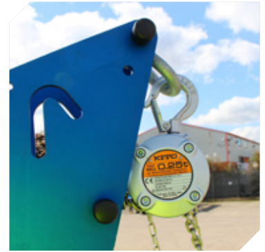
Chain block for accurate positioning