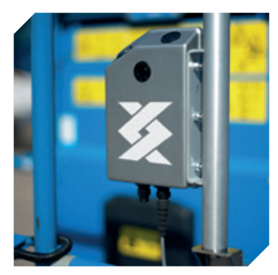
PCS protects your operators, and reduce risk of damage to structure and MEWP