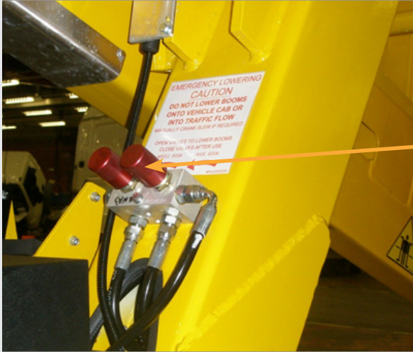
The two red taps mounted on the A-frame

NB: ENSURE THAT BOTH TAPS ARE CLOSED AFTER USE